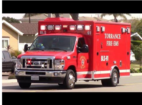
Torrance Fire Dept. BLS ambulance

This author learned that Torrance does not need to rely on a private ambulance service when the paramedics indicate that a patient needs to be taken to the hospital. The Torrance Fire Department has its own big red square ambulances that have BLS (Basic Life Support) written on the sides. The official paramedic rescue squad will return to Fire Station 4 May 2023 when the remodeling is complete.