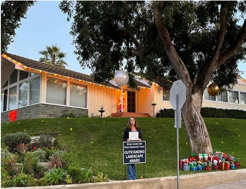
The Ganis residence 170 Monte d'Oro