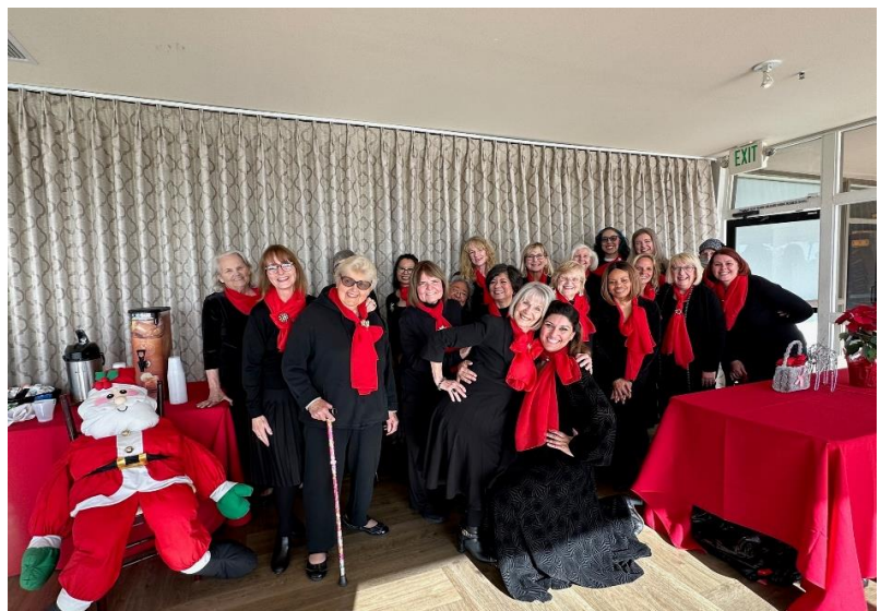
PHOTOS FROM THE 2022 HOLIDAY PARTY